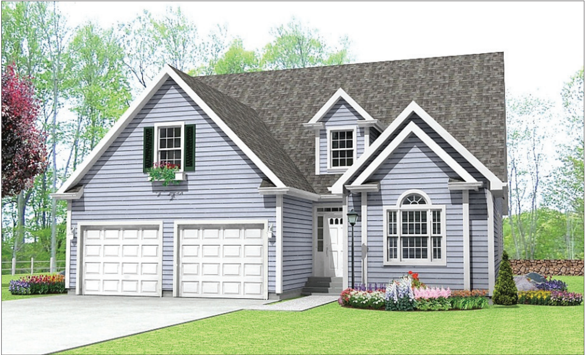
The Madison 2,344± SQ. FT.